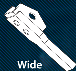
Wide Saddle Pin